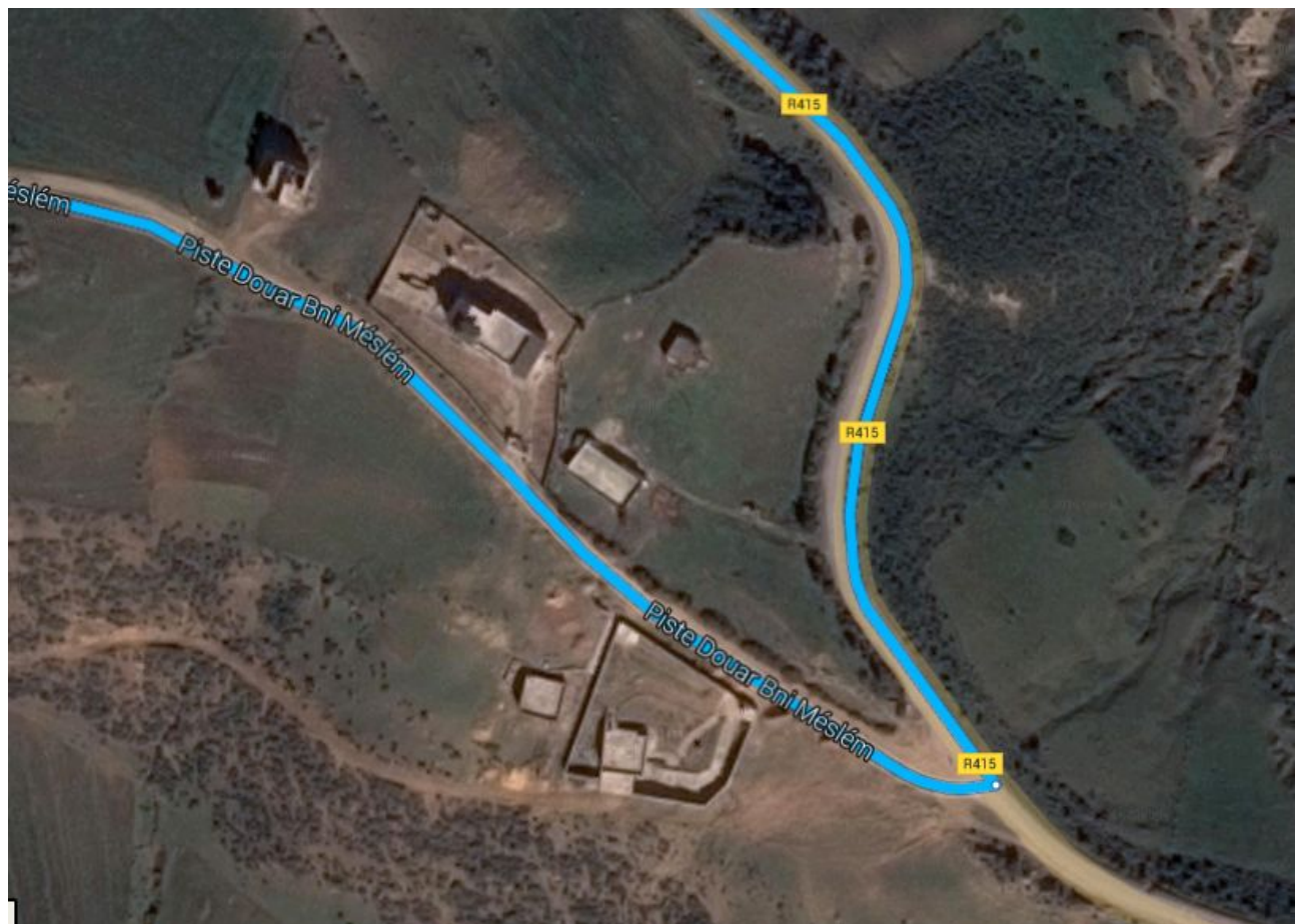
The sharp turn from the R415 onto the dirt track.