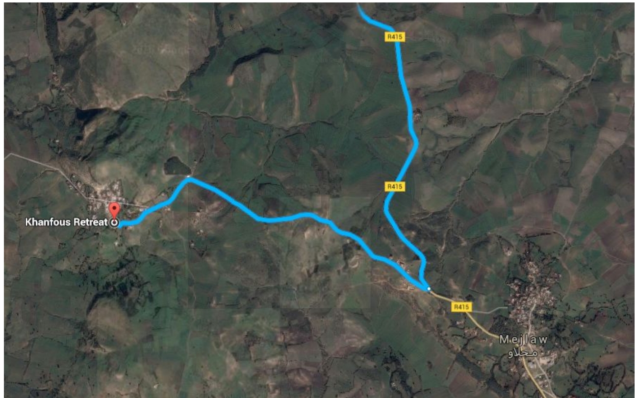
The route to Khanfous Retreat from the R415